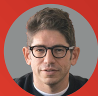
Yancey Strickler Kickstarter