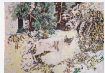
CHRIS HUEN SIN-KAN Balltsz 2024 Watercolour and coloured pencil on paper 57 x 77 cm