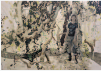
CHRIS HUEN SIN-KAN Haze 2024 Oil on canvas 220 x 320 cm