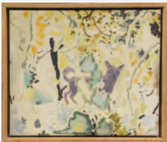
CHRIS HUEN SIN-KAN MuiMui 2024 Oil on canvas 26 x 31 cm