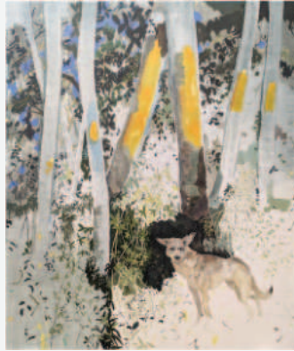
CHRIS HUEN SIN-KAN MuiMui 2024 Oil on canvas 240 x 200 cm