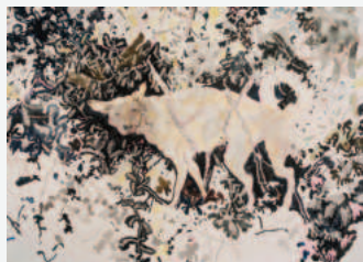
CHRIS HUEN SIN-KAN Balltsz 2024 Watercolour and coloured pencil on paper 57 x 77 cm