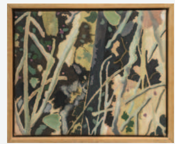
CHRIS HUEN SIN-KAN Balltsz 2024 Oil on canvas 26 x 31 cm